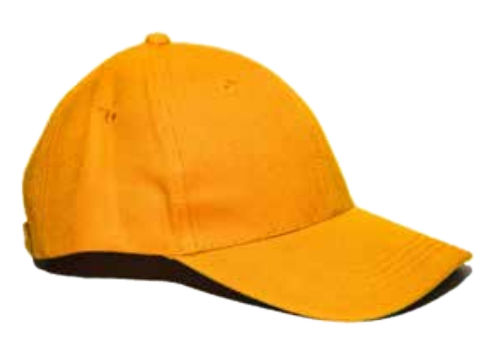
BC 007 (YELLOW)