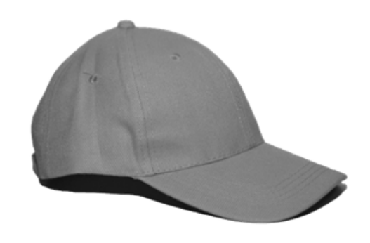
BC 006 (GREY)